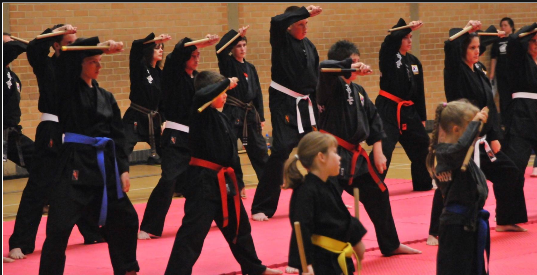
Dahn Bong (short stick) training

Through training you can become a more confident individual not only physically, but mentally as well, regardless of age or sex.